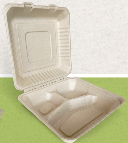
9" x 9"