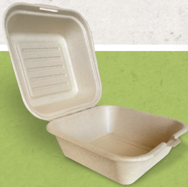
5.5" x 5.5"