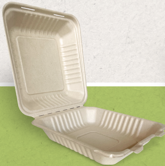
8" x 8"